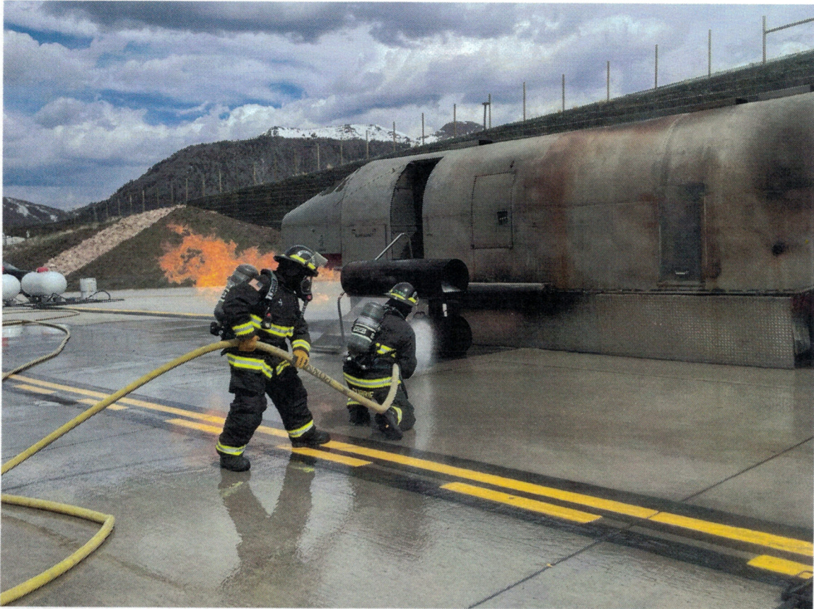
Annual Live Fire Training 05/10/23 – Mobile Simulator

TRAA Airport Update May 18, 2023 12:00 p.m. Airport Terminal Observation Lounge