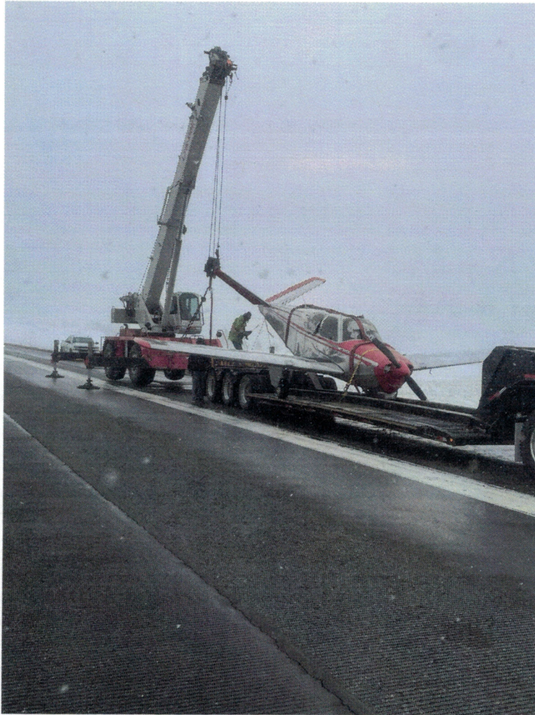
March 30 Beechcraft 35 Incident – No injuries

TRAA Airport Update April 2023 NO MEETING