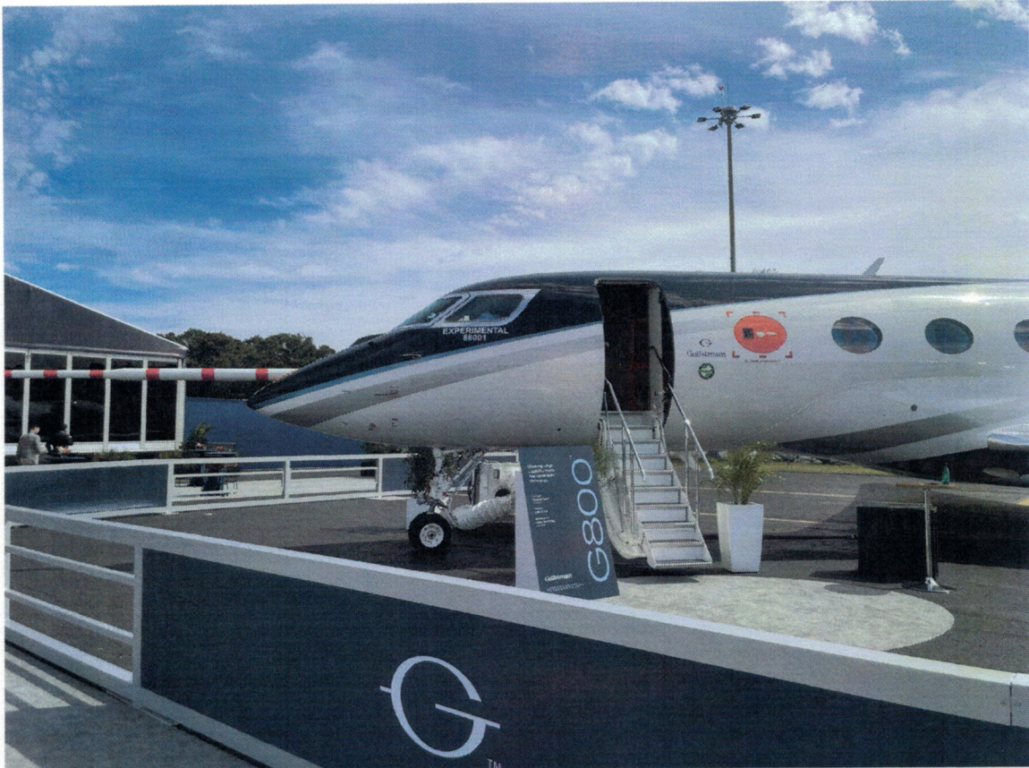
Gulfstream G800 NBAA 2022

TRAA Airport Update November 17, 2022 @ 12:00 p.m. Observation Lounge