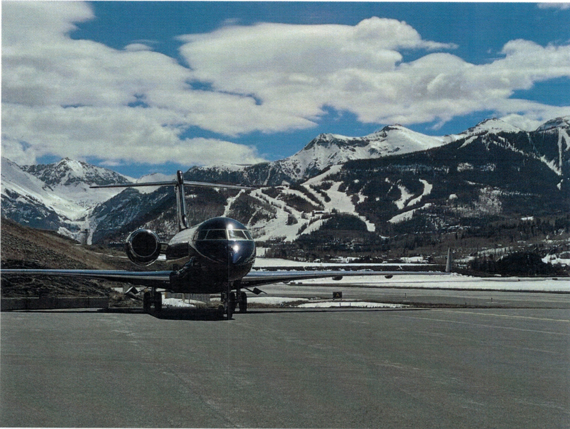
Bombardier Global 6000