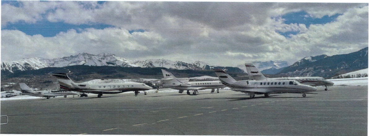
Busy Ramp March 8 th , 2021

https://zoom.us/j/96798516174?pwd=R2NuWIB2S1U5dkpzVDdlRFZHNURQT09