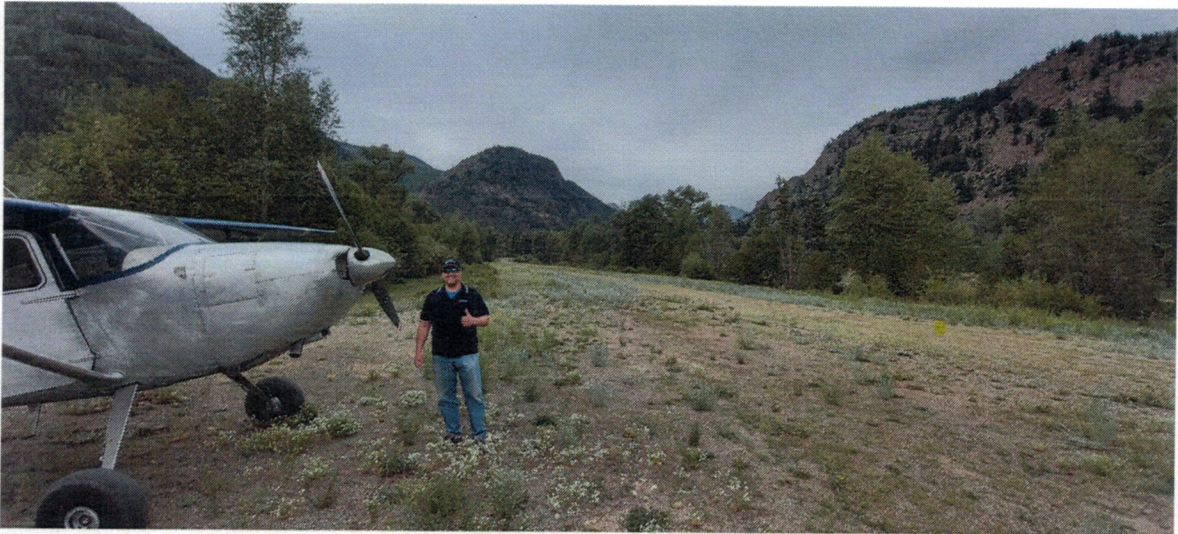
Flight into Castle Lakes Airport CD32 – Private Airstrip 27nm east of TEX.

Call 970-728-8606 Code: 81435 (do not press #)