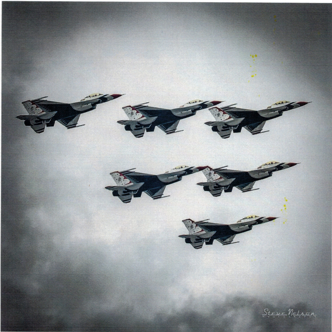
USAF Thunderbirds Flyover Colorado salute to Health Care Workers during Covid-19 Pandemic