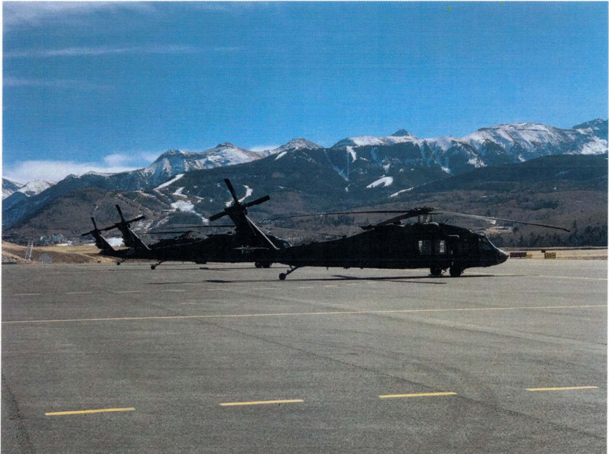
U.S. Army Blackhawks visit TEX 11/06/19

Meeting @12:00 p.m. Terminal Ticket Counter Lobby