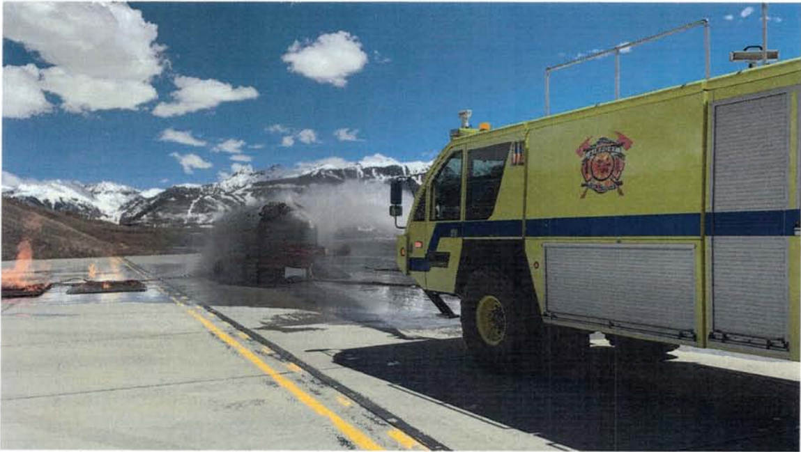
Aircraft Rescue Fire Fighting Training 4/25/19

May 15, 2019 Meeting 11:00 a.m. Observation Lounge