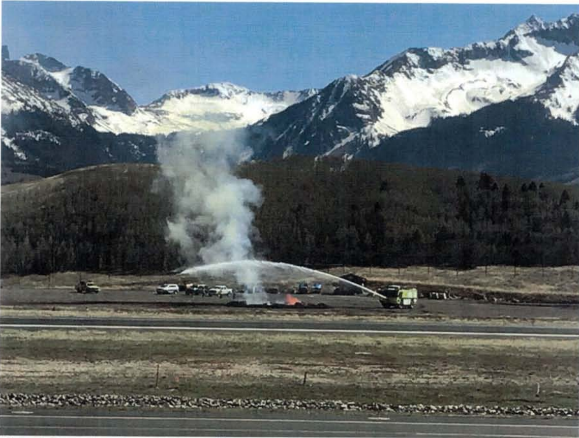
Airport MCI – Triennial Exercise May 8 th , 2018