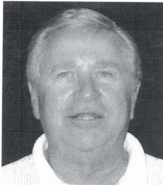
Airport Authority Board Chair 24 years