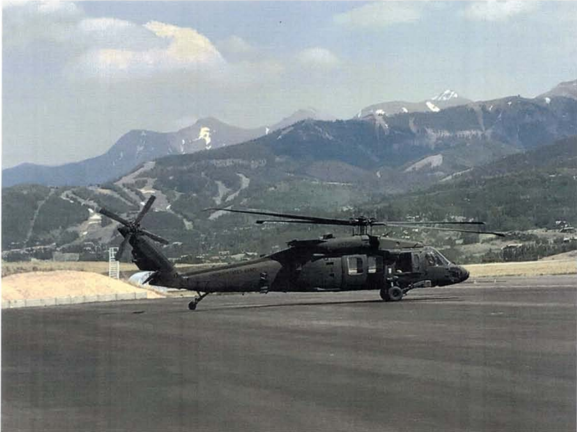
Army Sikorsky UH-60 Blackhawk Helicopter visit to TEX May 2018