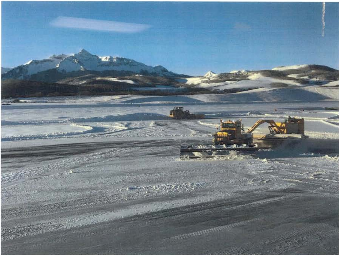
Snow Removal 12/13/18

December 20, 2018 @ 12:00 p.m. Terminal Observation Lounge