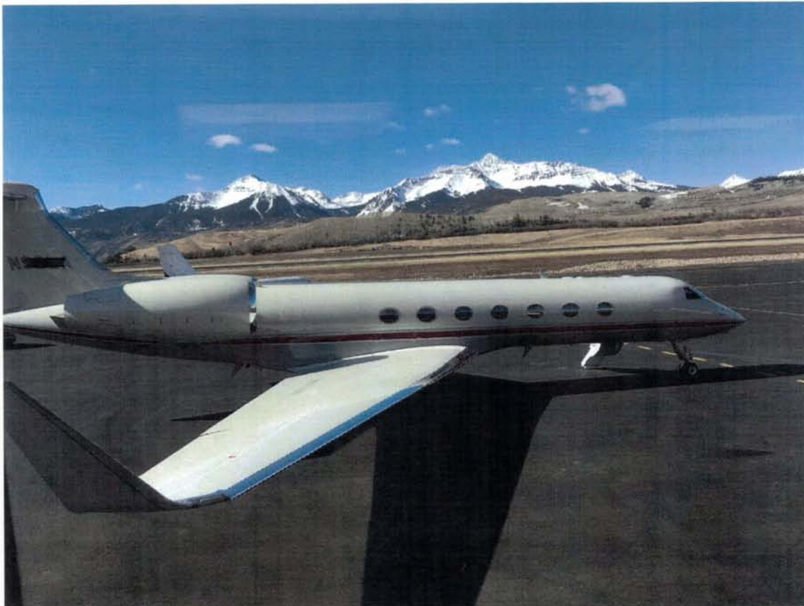
Gulfstream G550 April 9, 2018