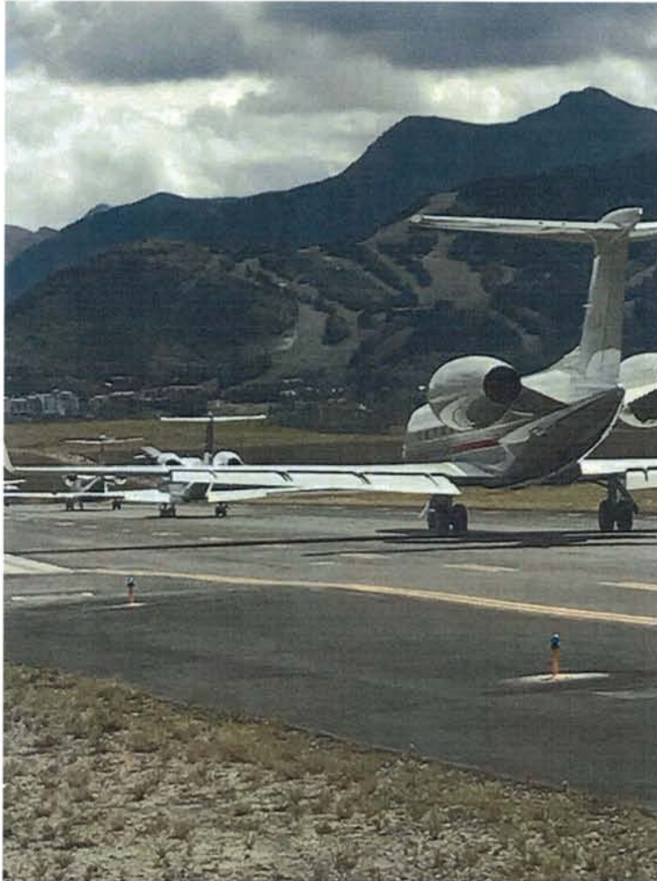
Labor Day weekend – Aircraft staged for departure on Taxiway A